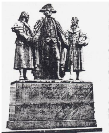
IN CHICAGO, ILLINOIS, THE ONLY OTHER STATUE TO HAYM SOLOMON, STANDING TO THE LEFT OF GEORGE WASHINGTON, AND ROBERT MORRIS ON THE RIGHT.

To ensure the success of the American Revolution, Salomon traveled to France and raised the equivalent of an additional 3.5 million British pounds sterling to finance the cause from the Sassoons and Rothchilds, the famed European Jewish financial dynasties. So we should also list the Sassoon and Rothchild families as additional heroes of the American Revolution! Their ideas spilled over to many other nations of the world. There is an unfair and blatantly wrong-headed accusation that the Rothchilds are part of the "Illuminati." In truth, they stood for democracy and justice.